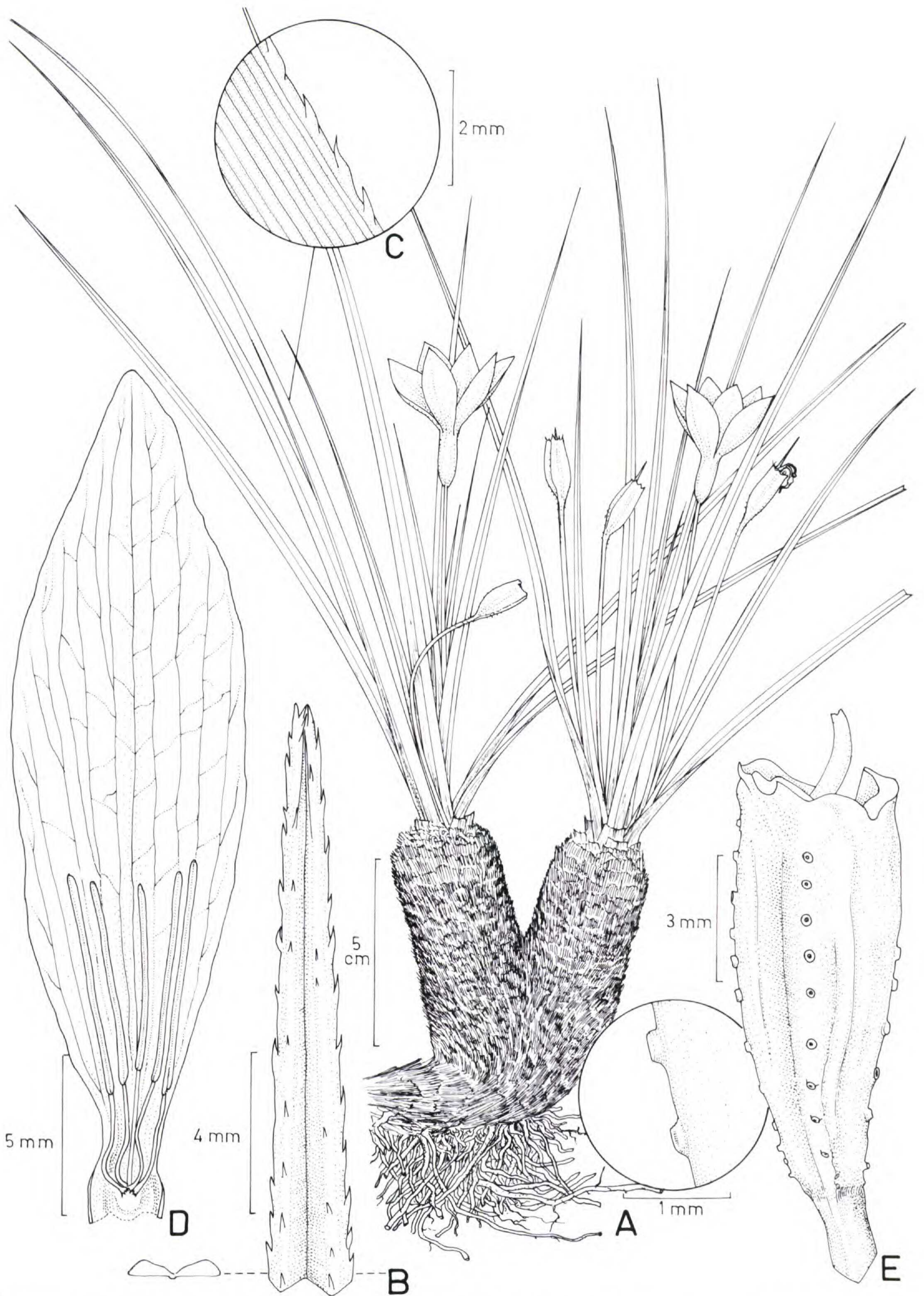
Figure 1. Vellozia stenocarpa Mello-Silva. —A. Habit. —B. Leaf apex, adaxial surface. —C. Leaf margin. —D. Petal, with stamens at base. —E. Fruit with detail of glands. A, Hatschbach 42920. B, E, Mello-Silva CFCR 9664. C, D, Simonis CFCR 4107.